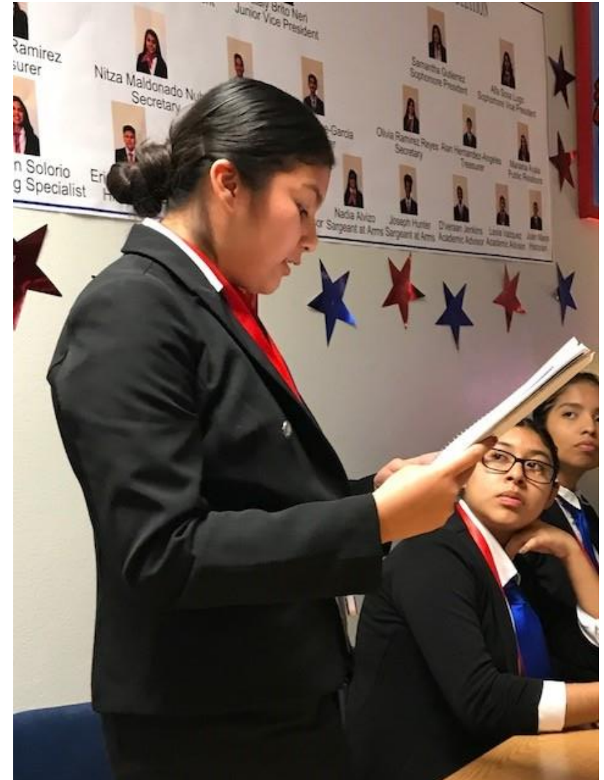
A JAG Western student presenting to her fellow students on a JAG professional Dress Day.